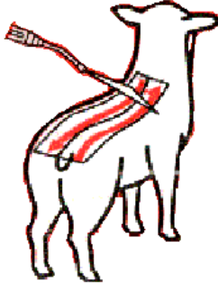
For the prevention of body strike

CYRAZIN Spray On should not be diluted prior to application. It should be applied using an appropriate applicator gun, with the gun held approximately 25cm above the fleece so that a 15cm wide band is applied. Application sites to prevent body and crutch strike are illustrated in the diagrams below.